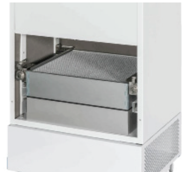
All around Acoustic Insulation