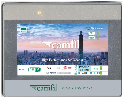
HMI Touch Screen