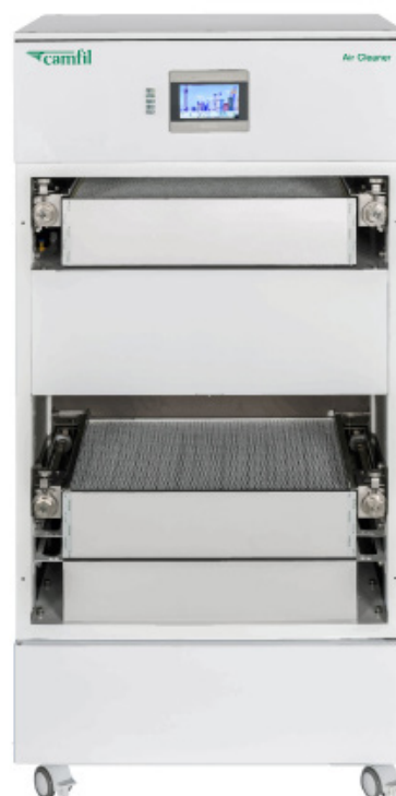
Air Cleaner CC 1000 Art. number: 94000181